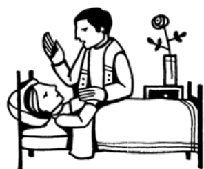
Anointing of the sick